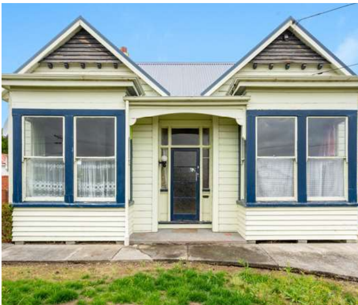
59 Johnson Street, Milton