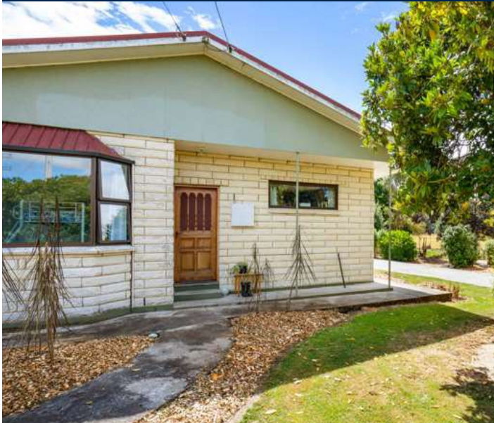
3 Lockharts Road, Waitahuna