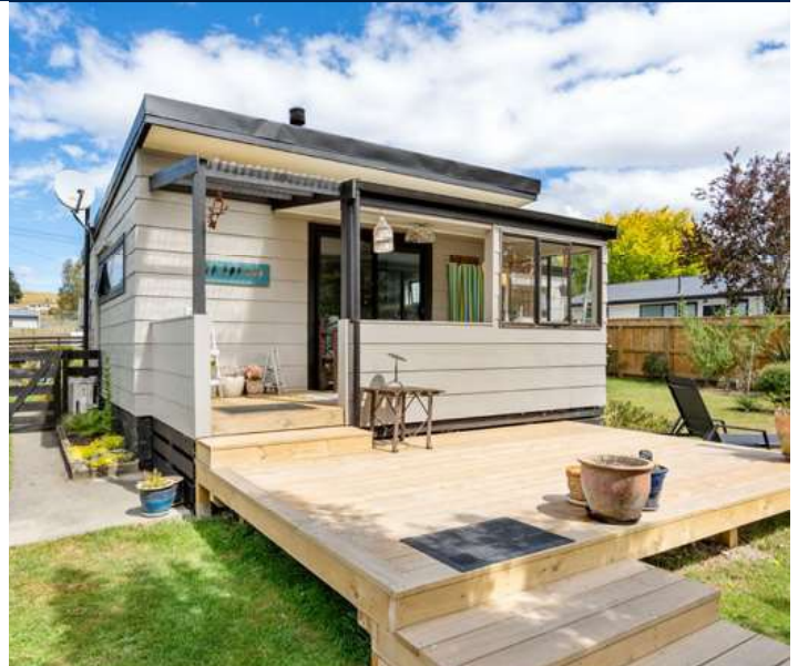
13 Harrington Street, Lawrence