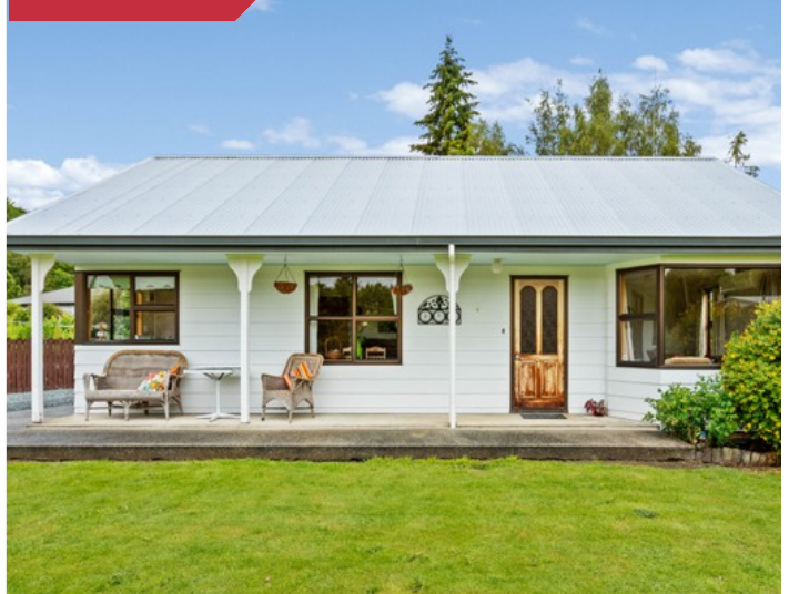
14 Iona Street, Lawrence