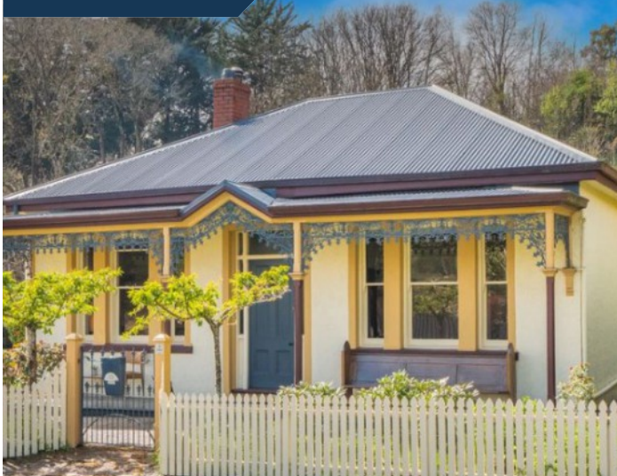
13 Whitehaven Street, Lawrence