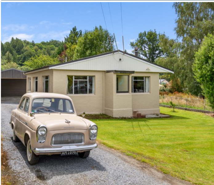
19 Campbelton Street, Lawrence